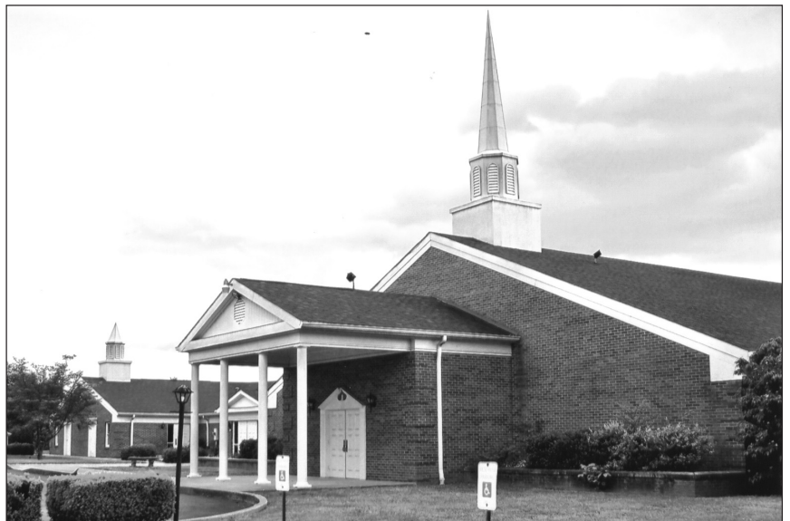
Cave City Baptist Church